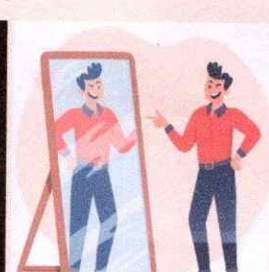
Developing Self Esteem