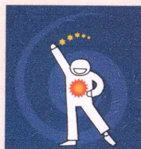
Becoming Rail Karmayogi