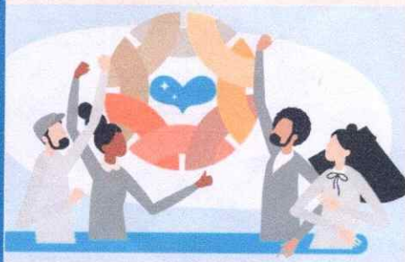
Understanding Organizational Needs