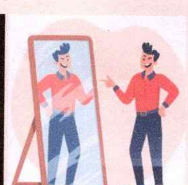
Developing Self Esteem