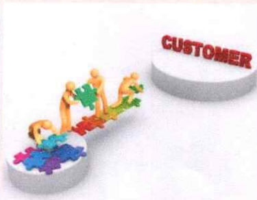
Understanding Customer Needs