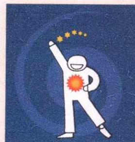
Becoming Rail Karmayogi